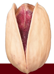
Ahmad Aghaei Pistachios